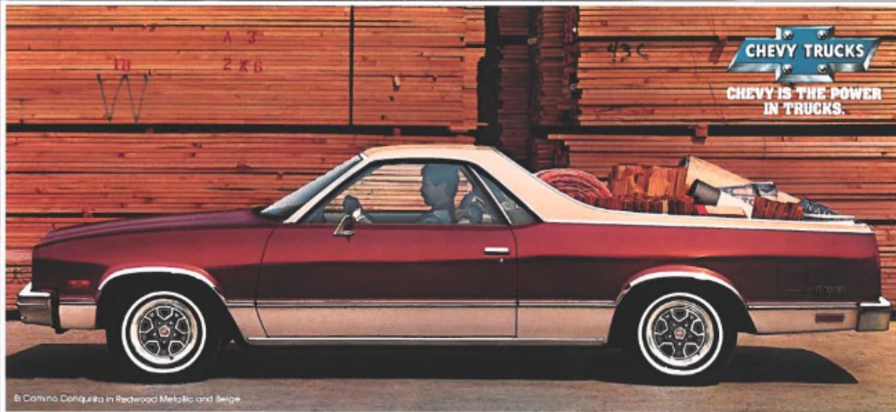
B Camino Conquista in Redwood Metallic and Beige